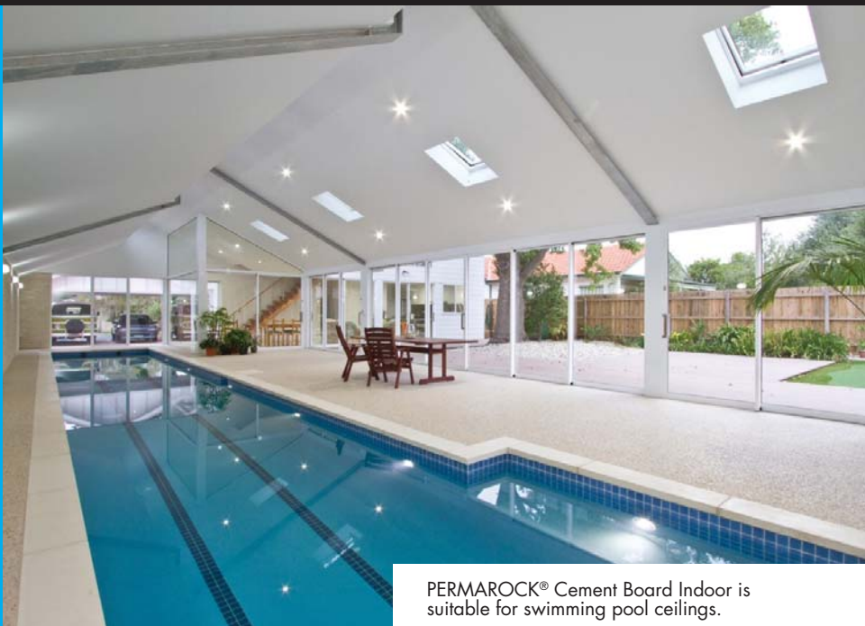
PERMAROCK® Cement Board Indoor is suitable for swimming pool ceilings.

PERMAROCK® Cement Board Indoor is a solid, engineered wall and ceiling lining made from inorganic aggregated cement embedded with coated glass fibre mesh. It has a high dimensional stability when exposed to moisture or temperature variations, is highly resistant to impact and has good sound insulation and has all properties that are required in water-intensive areas such as swimming pools, spa areas, bathrooms and commercial leisure facilities.